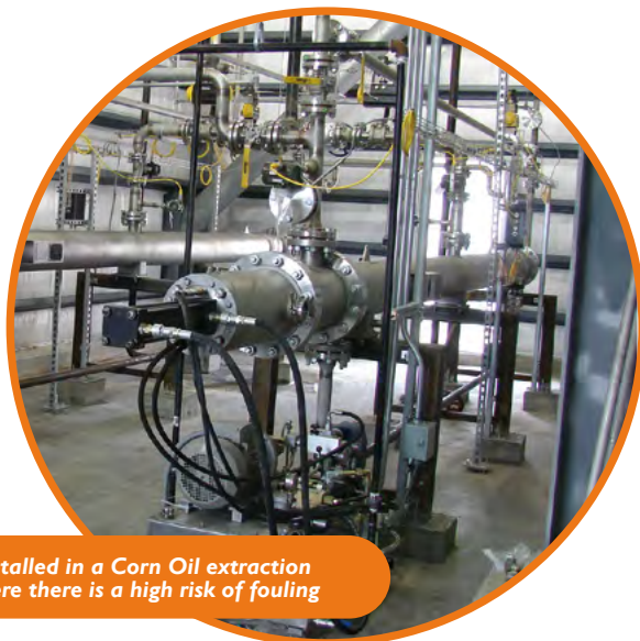
HRS Unicus installed in a Corn Oil extraction application where there is a high risk of fouling