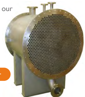
Exhaust Gas Cooler

The HRS G Series is an ideal heat exchanger for cooling CHP exhaust gas. The corrugated tubes can work with smaller heat transfer areas than traditional smooth tube heat exchangers. Our G Series units can be integrated and used to deliver thermal energy from the CHP units to our DPS and DCS systems.