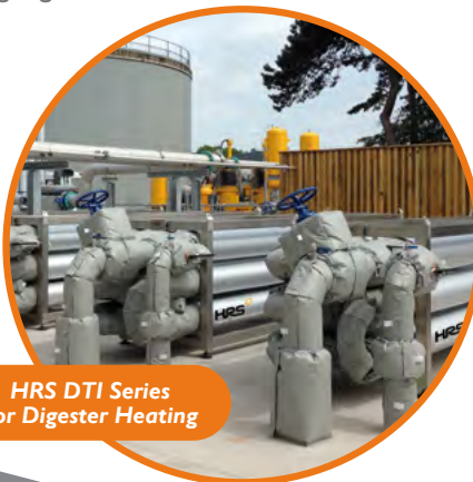
HRS DTI Series for Digester Heating