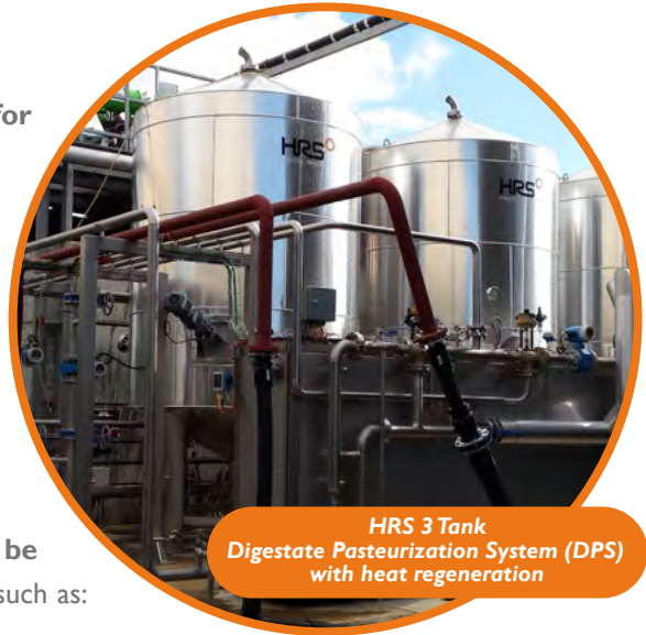
HRS 3 Tank Digestate Pasteurization System (DPS) with heat regeneration