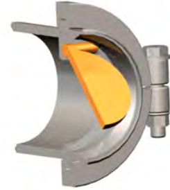
Clap valves allow pumping of whole fruits or vegetables