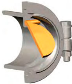
Clap valves allow pumping of whole fruits or vegetables