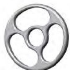
Scraper 360° with 3 holes