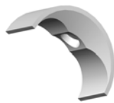
Scraper 180° mechanised