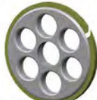
Scraper 360° with 6 holes and a peek ring