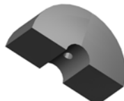
Scraper 180° compact