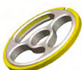
Scraper 360° with 3 holes and a peek ring