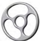
Scraper 360° with 3 holes