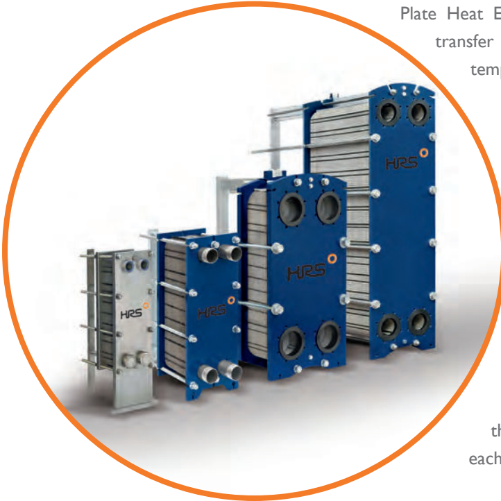
Plate Heat Exchangers (PHEs) are the ideal solution for heat transfer applications where product viscosities, particulates, temperatures and pressures are relatively low.

The highly efficient design also makes them an ideal choice where the required product outlet temperature is close to the service inlet temperature (close temperature approach), keeping the heat exchanger compact and cost effective.