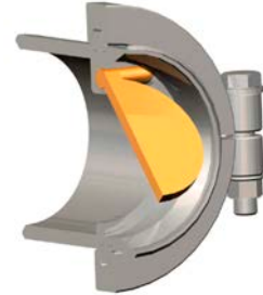
Clap valves allow pumping of whole fruits or vegetables