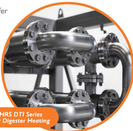
HRS DTI Series for Digester Heating