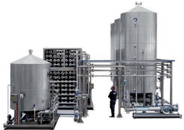
HRS 3 Tank Digestate Pasteurization System (DPS) with heat regeneration

Solutions are tailored for each biogas plant. The DPS or DCS can be individually selected or combined , depending on several factors such as: suitable thermal energy, digestate use, waste volume, etc.