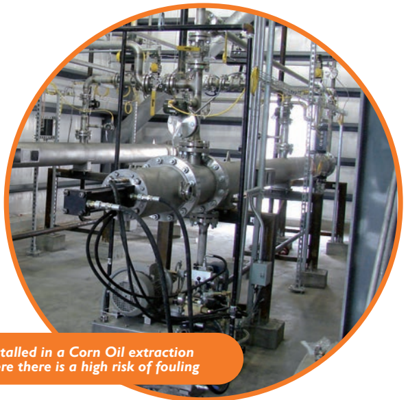
HRS Unicus installed in a Corn Oil extraction application where there is a high risk of fouling