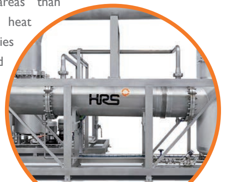
Exhaust Gas Cooler

The HRS G Series is an ideal heat exchanger for cooling CHP exhaust gas. The corrugated tubes can work with smaller heat transfer areas than traditional smooth tube heat exchangers. Our G Series units can be integrated and used to deliver thermal energy from the CHP units to our DPS and DCS systems.